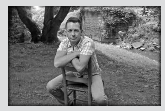
Featured 2014 Conference Keynote Address by Silas House

"Our Secret Places in the Waiting World: Becoming a New Appalachia"